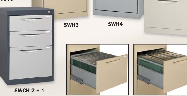
Standard Lateral Optional filing configurations